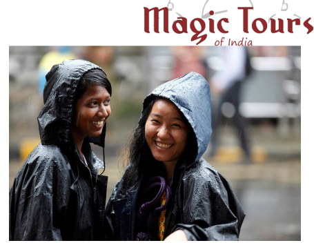
Two of our Mumbai guides

Our tours have positive outcomes for locals. In these tours we employ local people, especially those who come from lower income groups and marginalised segments of society. We incorporate components that bring our guests in direct contact with local culture, local development projects, craft and textile workshops, etc. We try to educate guests in a way that demystifies the exotic "Other". Guests interested in shopping also have a chance to purchase products directly from producers or at cooperative stores and fair price shops.