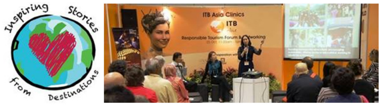
Magic Tours of India: Winner of ITB-Asia "Inspiring Stories" Responsible Tourism Award 2014

We are super-thrilled that this year, we won international recognition for the work we are doing in creating a happier world. This document explains the specific programmes which we have been working on, for which we won the "Top 3 Inspiring Stories from Asia" award at ITB-Asia Singapore.