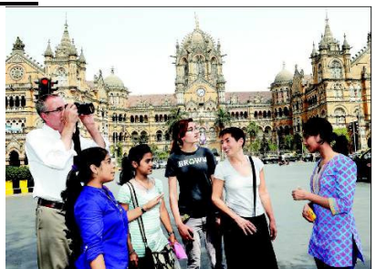
Visitors with student guides in front of Victoria Terminus, Mumbai.

• Our tours are fun. They are high quality. You don't have to book them because you feel sorry for someone. We don't want any "pity tourism". We want to offer tours that are actually worth every penny you pay for them. This is very important if we want tourists and locals to have a dialog on equal footing.